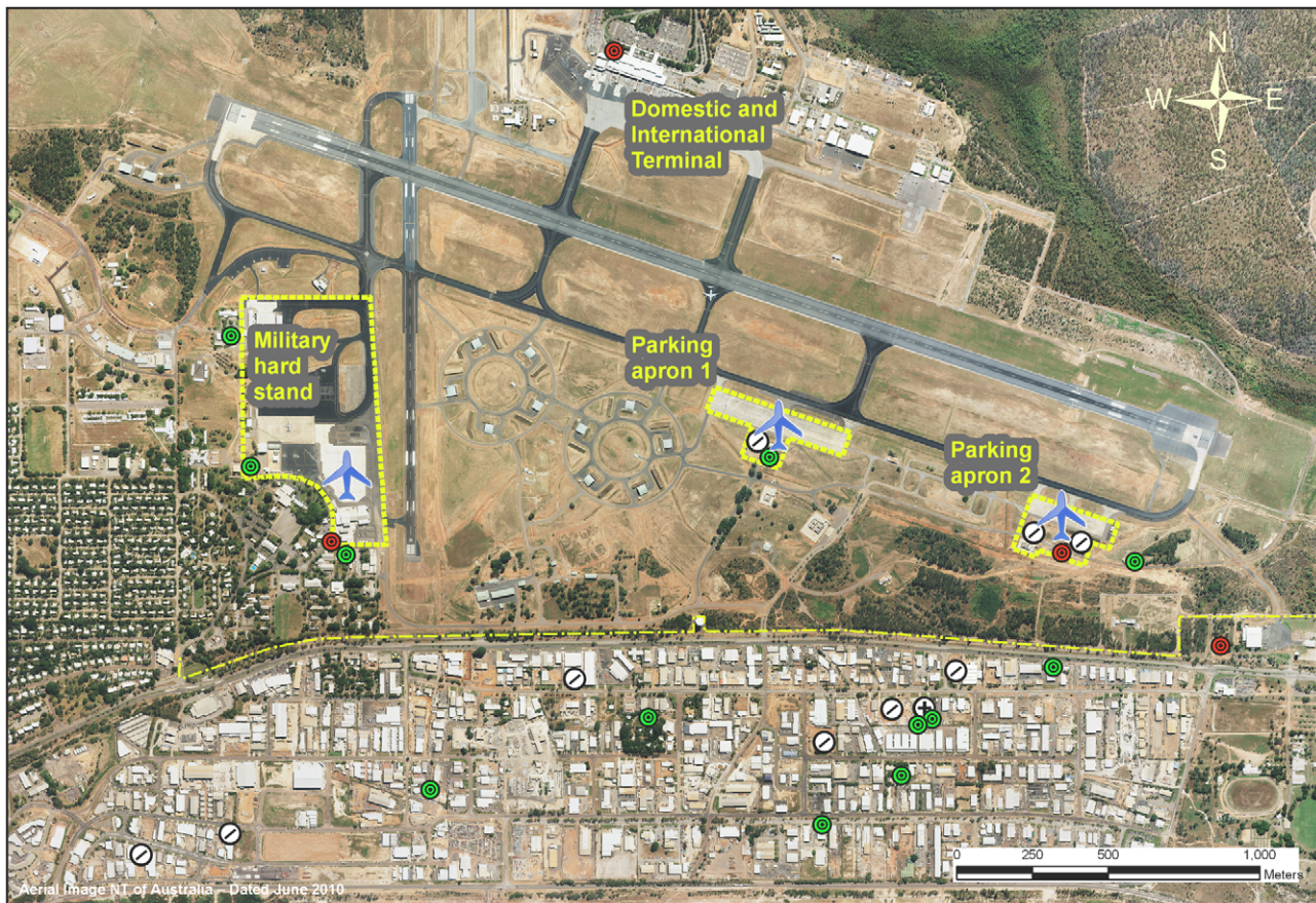
Figure 2. Local area of the case's workplace. Shown are: the case's workplace (cross in circle), containerised cargo delivery locations (dash in circle), apron boundaries (dashed line), southern airport boundary (dot and dash line), airplane arrival areas (airplane symbol), routine adult mosquito traps (red circle), and extra case adult mosquito traps (green circle). doi:10.1371/journal.pntd.0001619.g002

possibility that it was acquired from an infective mosquito which escaped this aircraft.